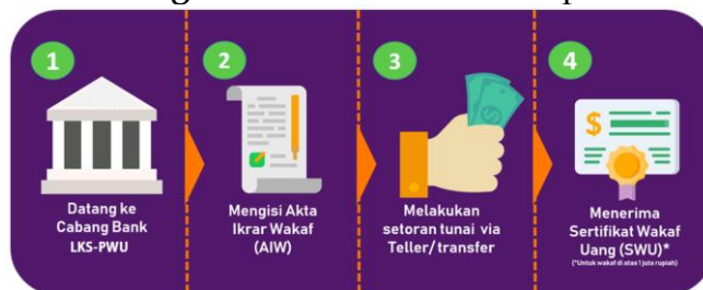
Figure 1: Flow of Cash Waqf

and make payment. The waqif will then obtain a cash waqf certificate, as can be seen in the figure below: